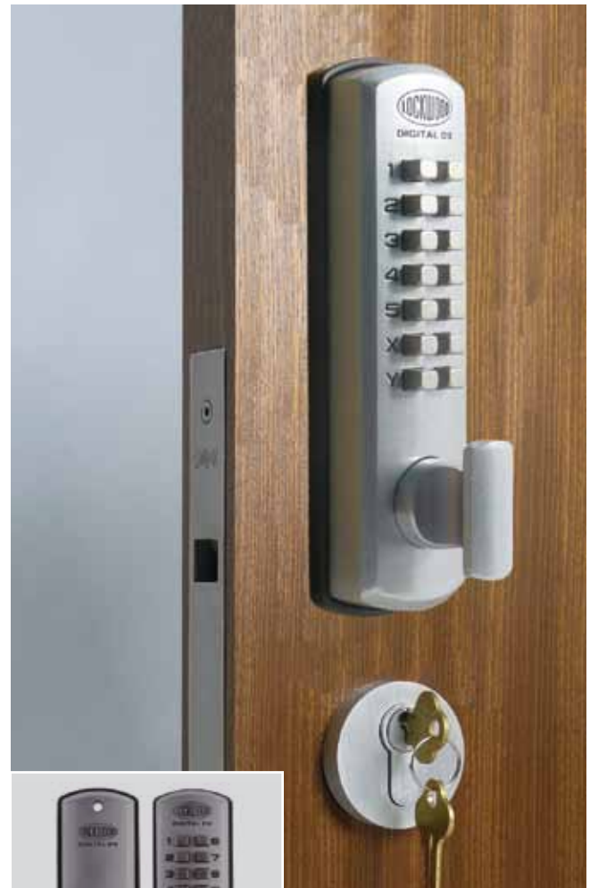
CL100 DigiLock with key locking fitted to a timber veneer door.

Digital locks are easily programmable to suit pass code of your choice. Full instructions are included.