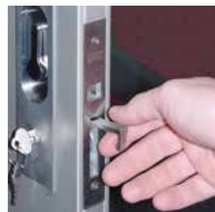
▲ Satin Chrome Louise fitted to a CS NewYorker door.

This Flush Pull is designed for use on doors which slide completely inside a cavity pocket.