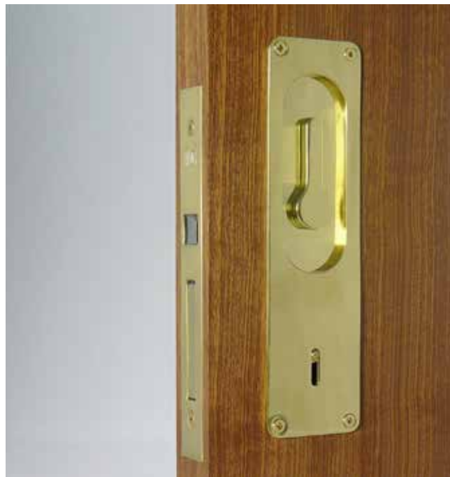
▲ A polished brass Louise with emergency release, fitted to a timber veneer door.